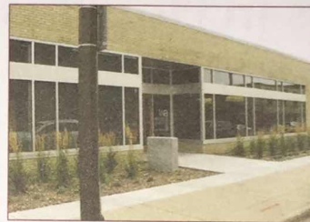
Commercial/Industrial/Office: Wilkus Architects, PA, 15 9th Ave N