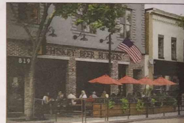
Commercial/Industrial/Office: Pub 819, 819 Mainstreet